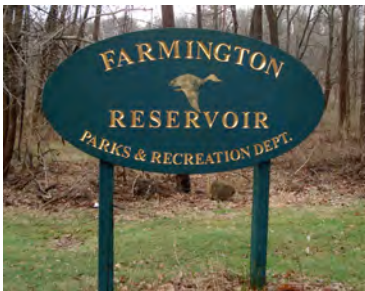
Reservoir Dam parking

Parking for the Reservoir Rock Trail (41° 42' 35.67" N 72° 49' 48.44" W) is just before the junction with the Colt Highway (rt. 6). The trail starts at the gate climbing the first 0.2 mile on a wide gravel road that parallels rt. 6. When you see the large concrete cistern with a small stone cairn on the southwest corner (center of the photo taken in May), climb the steep bank bearing to your right. Follow the right wall that is almost parallel to rt. 6. At the southeast corner, there is another small stone cairn marking the right turn into the woods. There is a third cairn at the start of the very short woodland trail that connects with the blue blazed Metacomet Trail. Turn left on the blue trail and ascend steeply up the ridge that borders the Reservoir. At 0.5 miles the trail goes around a very large rock that looks like an eagle's head with a blue blaze on its beak. This is Reservoir Rock (photo). Retrace your steps, since the blue trail continues north to Massachusetts. Allow 45 minutes for this 1 mile round trip hike, which goes up and down 160 feet of elevation. November through April would be the best 6 months to hike it, since there are great views west along the ridge, and the weed growth around the cistern would be low.