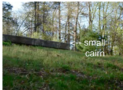
1st small cairn on cistern