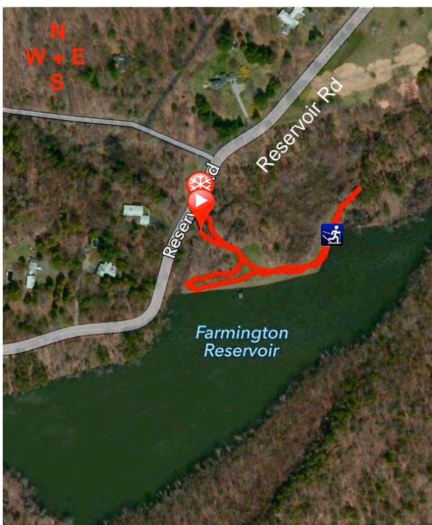
Reservoir Dam Trail