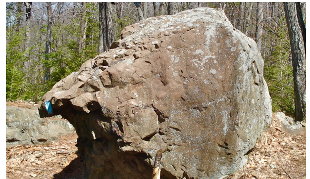
Eagle Rock marks the trail while keeping an eye on the reservoir below.

The New England Trail (NET) is one of eleven National Scenic Trails in the USA. The 233 mile trail connects Long Island Sound to Mt. Monadnock in New Hampshire. It crosses Farmington from south to north on the Metacomet Trail. The middle section crosses over Farmington Mountain, which is part of the Metacomet Ridge. Local hikers will tell you that they never “Met-a-comet” they didn’t like.