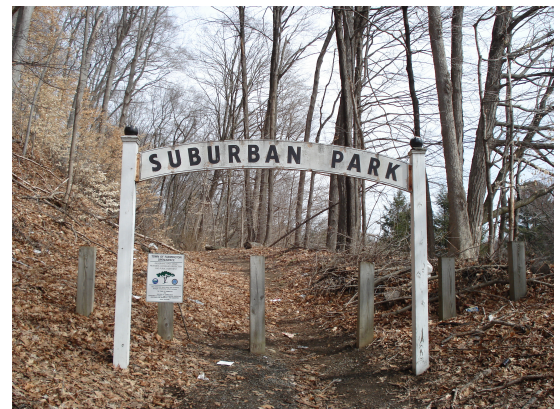
sign at Park Pond Place