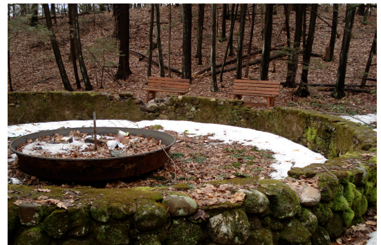
ruins of the electrified fountain