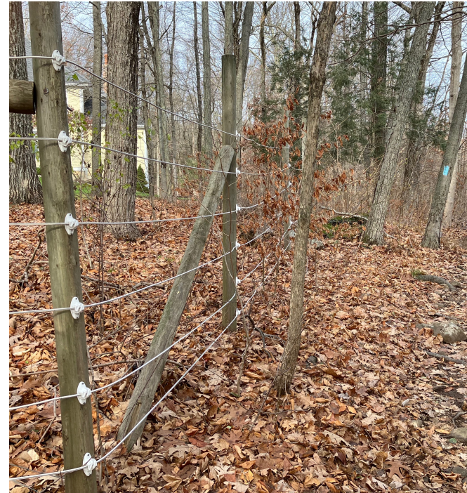
A potential shocking experience.