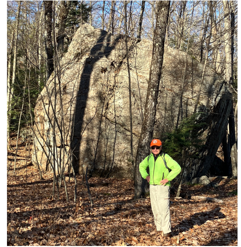
The mega erratic in Avon