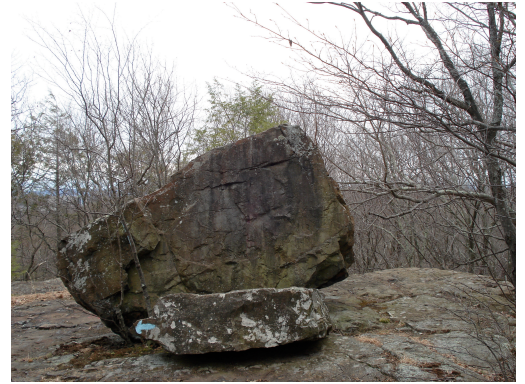
Glacial erratics on Kilkenny Rock