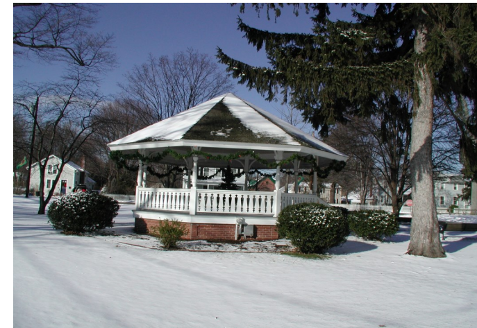
UHD indicates a property within the Unionville Historic District