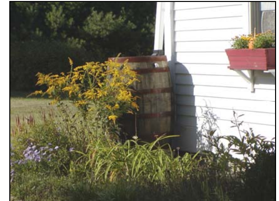
Rain barrels collect and store water from rooftop runoff for later use.