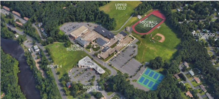
Aerial of existing campus