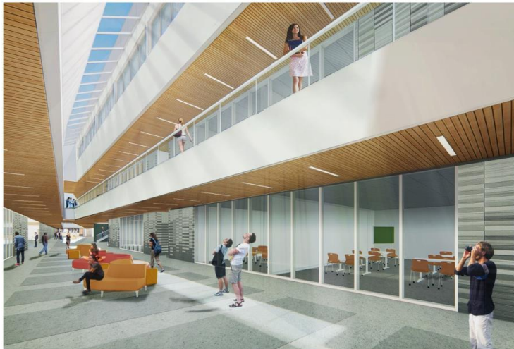
View along main north-south axis

This axis is bisected by an east-west axis running from the after-hours entrance. It is sufficiently wide to provide all the seating capacity for the cafeteria. Outside of lunch hours, it is available as a common space or lobby space for the Auditorium and Gymnasia populations.