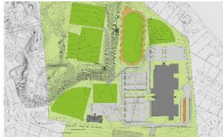
Site layout for east edge of property

Building on the football field will necessarily shift that site element to the eastern edge of the parcel. In addition to the cost of rebuilding the field, stands, and track, the group felt the football field is a much too intrusive neighbor to the abutting parcels, bringing with it the evening noise and lights.