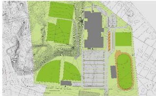
Site layout for football field

During Part 1, the design team worked with the Committee to evaluate construction sites for a new building. The New Building's site needs to provide ample building pad area, good access, clear circulation, and sufficient buffer from adjacent parcels, all the while minimizing disruption of the existing school's population and learning. Building on or adjacent to the existing building is out of the question. A site below the main school adjacent to the library is too tightly sloped to provide good, flexible building floor plates. A site above the main building on the upper field does provide good, level ground but is difficult to access due to its remoteness and steep grade changes. It is tight against regulated natural diversity habitat zones and abutting residential neighbors. Ultimately, two potential sites remained - atop the football stadium or along the parcel's eastern edge. Both sites provide large, flexible building pads, good access, are well buffered for circulation, and are shifted sufficiently from the existing circulation and education spaces. However, each site impacts the adjacent parcels differently.