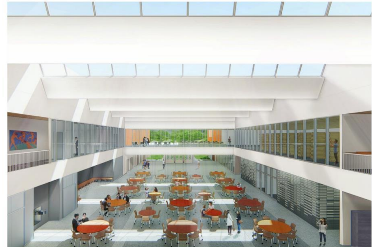
View along east-west axis looking down on cafeteria

Administrative spaces are clustered along the New Building's main entry at the drop off loops, providing good "eyes on the street" for the school's comings and goings. Primary administration is located along the ground floor. Counseling is located along the second floor. The Learning Communities are grouped in pairs and stacked three stories. Section V. discusses the Learning Communities in detail. The long the main north-south axis ends with a two-story career education and visual arts cluster. Performing arts, theater and music spaces are clustered to one side of the Cafeteria and indoor athletic spaces, including the Gymnasia, are clusters to the other side. The Media Center, or Learning Commons sits on the second floor overlooking this gathering space.