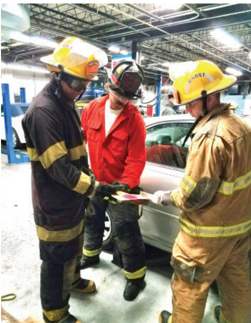
Fire Fighters training Fire Cadets

the chance of survival of a victim decreases by 7 to 10 percent. The Town of Farmington is a HEARTSafe Community, which is a community that has documented the "Chain of Survival" links to address cardiac emergencies for its citizens. These links include early access to emergency care, early CPR, early defibrillation, and early advanced care. The Town of Farmington Fire Department also is available to instruct at businesses, schools and daycares in order to ensure this vital training is maintained within our community. Please contact us if you are interested.