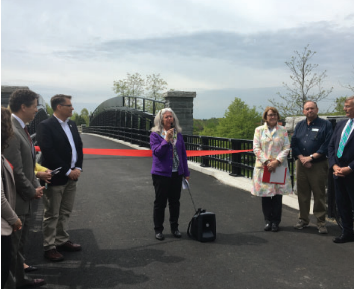
5/16/18 The Town of Farmington and the State of Connecticut held ribbon cutting ceremony for for the Farmington Canal Heritage Greenway (FCHG) – a 2.4-mile paved, off-road multi-use trail along a former railroad bed that completes the FCHG in Farmington

The Town Council is pleased to provide you with the Annual Report for the Town of Farmington for the July 1, 2017 to June 30, 2018 fiscal year. As you read through the report, you may note the wide range of important services that we provide our citizens and business community. I know that I speak for the entire Town Council when I express the pride we have in our community, schools, and our Town employees. We hope that you find this report useful and informative.