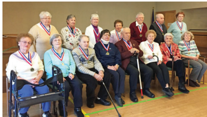
Some of our 50 plus life members. To become a life member you need to belong to TSCA for 20 years and be over 80 years old. Congratulations to these members!