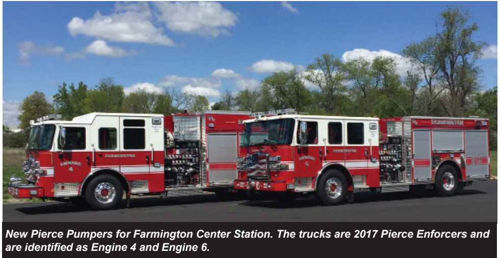
New Pierce Pumpers for Farmington Center Station. The trucks are 2017 Pierce Enforcers and are identified as Engine 4 and Engine 6.

The Fire Department provides instruction on American Heart Association courses for CPR and First Aid. More than 350,000 cardiac arrests occur outside the hospital each year. Instructors within the department provide Community CPR instruction quarterly, at no charge, at the Community/Senior Center. These courses are instrumental to teaching members of the public the necessary skills to recognize a cardiac arrest, get emergency care on the way quickly and provide CPR until a high level of medical care arrives. These courses also incorporate the use of an Automated External Defibrillator (AED). The use of an AED within three to five minutes after a collapse greatly increases the chance of survival. For every minute that passes without CPR or defibrillation,