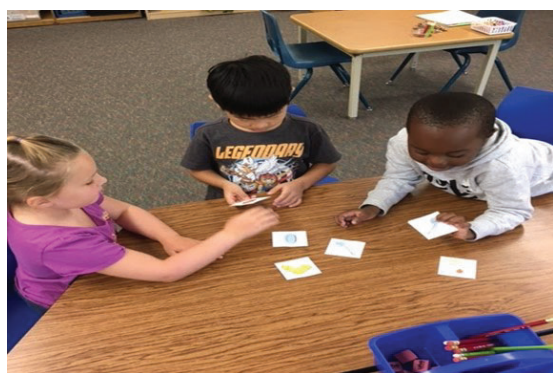
Collaboration and Communication