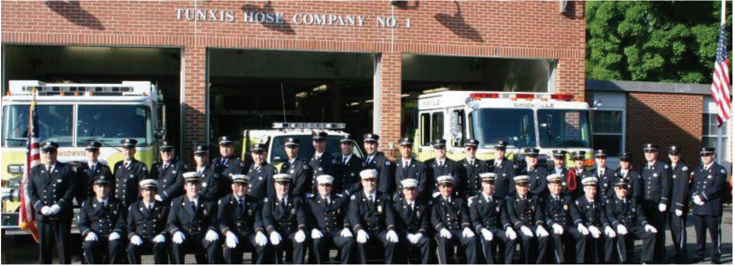
TUNXIS HOSE VOLUNTEER FIRE DEPARTMENT