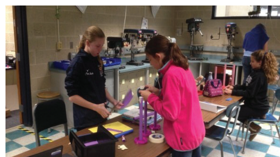
Critical Thinking and Reasoning