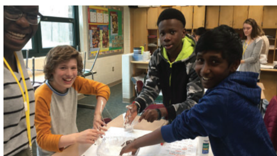
Problem Solving and Innovation