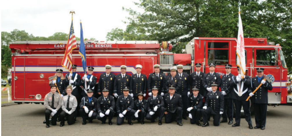
EAST FARMS VOLUNTEER FIRE DEPARTMENT