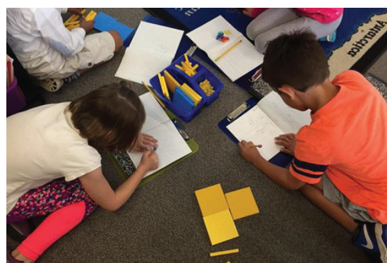
Self-Direction and Resourcefulness