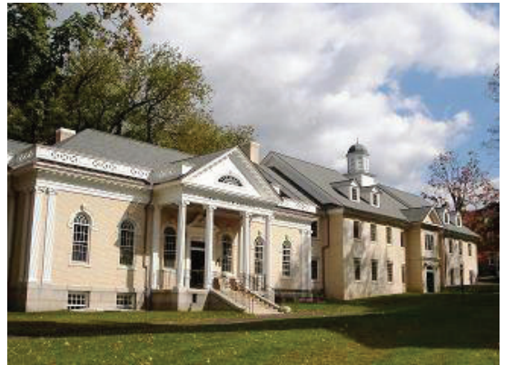
The Farmington Food Pantry is located on the lower level of Amistad Hall on the campus of First Church Congregational 75 Main Street, Farmington, CT

Since 2006, the Farmington Food Pantry has been located in Amistad Hall at The First Church of Christ in Farmington, operating with a Board of Directors under the Outreach Committee of First Church. Following a mission to provide a "respectful, empowering environment, where supplemental food and personal care items are available to individuals who need assistance in Farmington", the pantry currently serves over 208 Farmington families – a number that continues to grow each year. The pantry operates on a "Clients Choice" program which allows clients to pick the items they like and need, rather than being given a pre-packaged bag of food. As a partner agency of Foodshare, the pantry can receive food and household necessities for a nominal amount. The pantry is funded solely through donations and staffed entirely by volunteers. All clients are pre-qualified by social workers from the Farmington Community & Recreational Service town department. Additionally, Farmington Community Services staff provides support during Tuesday shopping days, allowing for increased communication with clients.