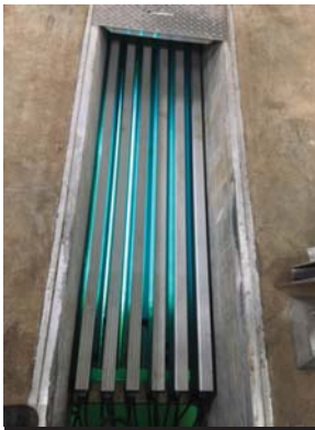
Water passing through the bulb channels for treatment

The comprehensive upgrade to the Town's Water Pollution Control Facility began in March of 2016. After 2 years of construction, many of the new process facilities are being put into service this spring, including the Ultra Violet Disinfection system. This has eliminated the use of chemicals that were previously used to disinfect the treated wastewater. The project is currently running on schedule and is nearing 75 percent completion, with $43,034,293 paid as of February 29, 2018. The completed facility will produce a higher quality effluent with greater reliability and efficiency for years to come.