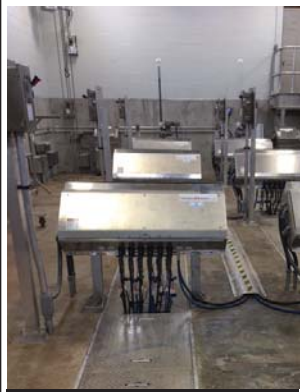
The inside of the UV Disinfection Building