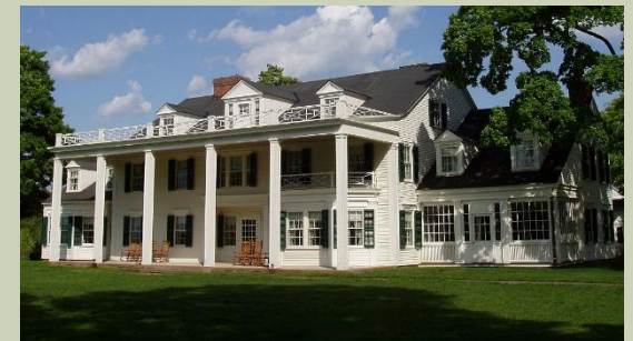
2 ½ Story 110 Foot Long West Façade