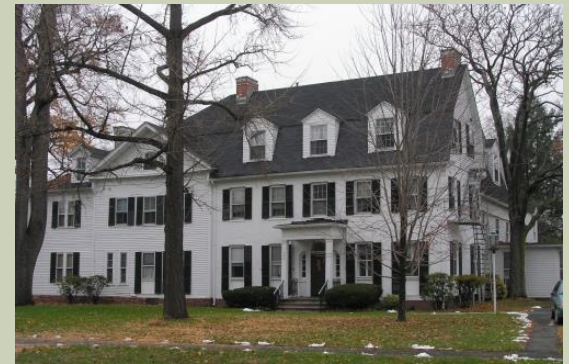
90 Foot Long Façade along 2 ½ Story