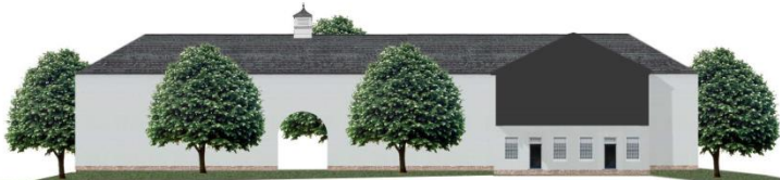
OPENING TO COURTYARD