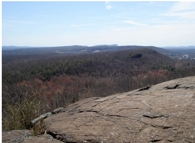
Rattlesnake Cliffs southern view of the Metacomet Ridge