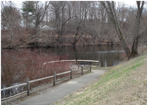
Farmington's fishing pier