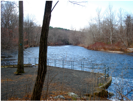
Unionville's fishing pier