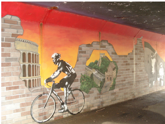
Unionville's Trail #1's Artist Tunnel