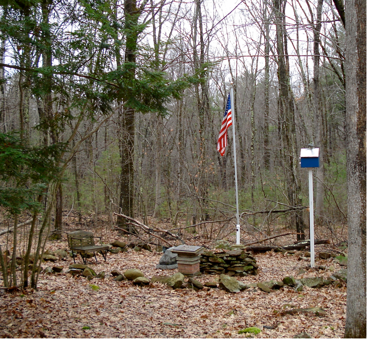
2nd Lt. Vincent H. Core's Memorial

blazes (O). At 1.2 miles make a 90° left turn and follow the red trail (R) back to your car.