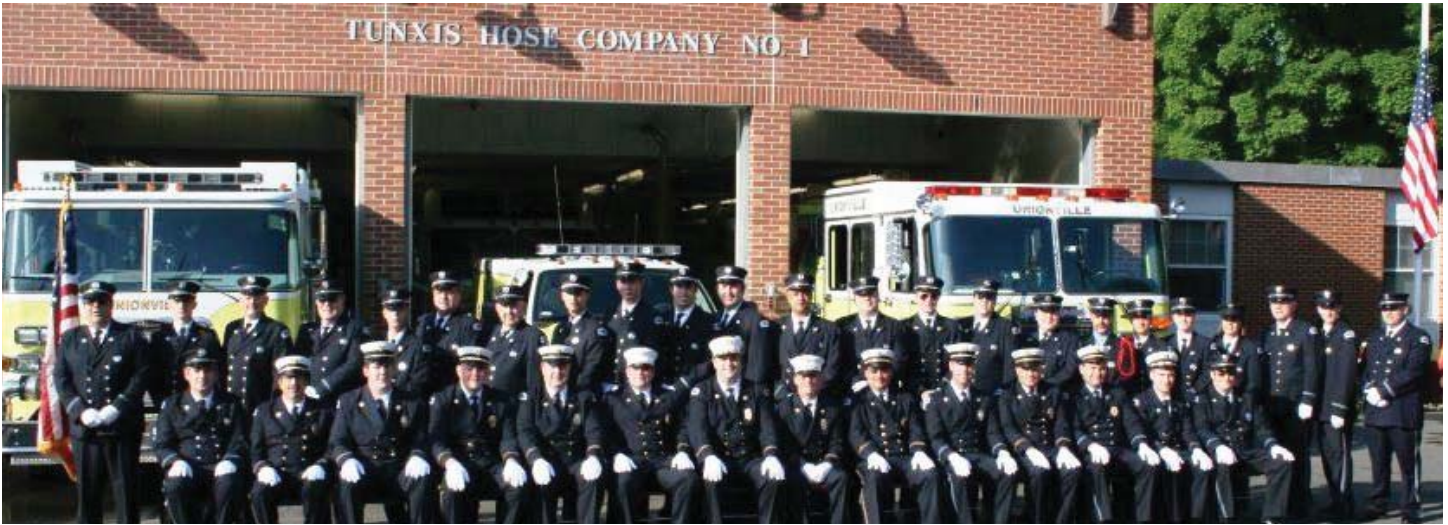
TUNXIS HOSE VOLUNTEER FIRE DEPARTMENT