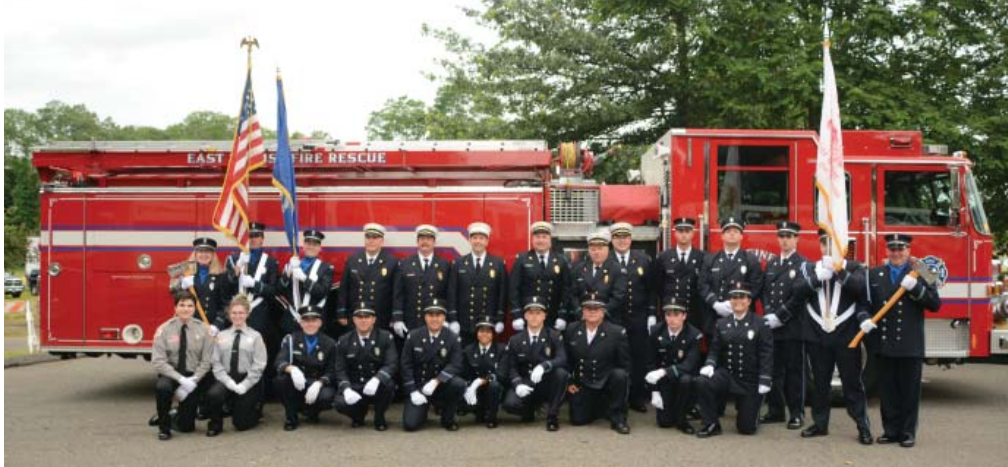
EAST FARMS VOLUNTEER FIRE DEPARTMENT