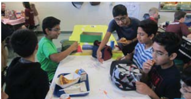
Problem Solving and Innovation