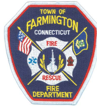
TOWN OF FARMINGTON FIRE DEPARTMENT