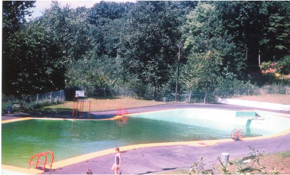
~ Photograph courtesy of Unionville Lions Club