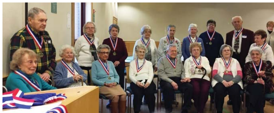
Just a few of our 50+ life-time members. To become a life-time member, you need to belong to TSCA for 20 years and be over 80 years old. Congratulations to these members!