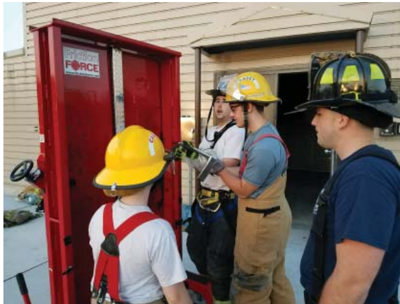
TOWN OF FARMINGTON FIRE CADETS TRAINING