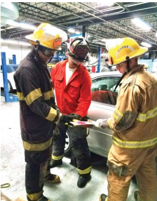
Fire Fighters training Fire Cadets

The Town of Farmington Fire Department has a Knox Box Program in place to facilitate immediate access to a secured building during an emergency. Knox Boxes are locked metal boxes that hold the keys to the building on which they are installed. Each Town of Farmington Fire Apparatus is equipped with a Knox Box that contains the "Farmington Knox Box Key" which opens all of the Knox Boxes installed on buildings in the Town of Farmington. The Knox Boxes installed in the fire apparatus are controlled electronically by signals initiated by the Farmington Public Safety Communications Center. The installation of a Knox Box at a property allows the Fire Department quicker, easier access to a property in the event of an emergency, thereby helping to save lives and eliminate property damage that might otherwise occur as a result of the Fire Department forcing entry into a building to render assistance. Residents or Business owners who are interested in installing a Knox Box are encouraged to contact the Fire Department.