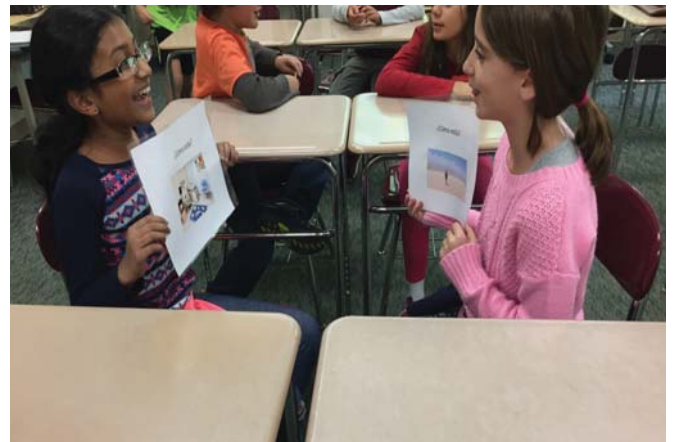
Self-Direction and Resourcefulness