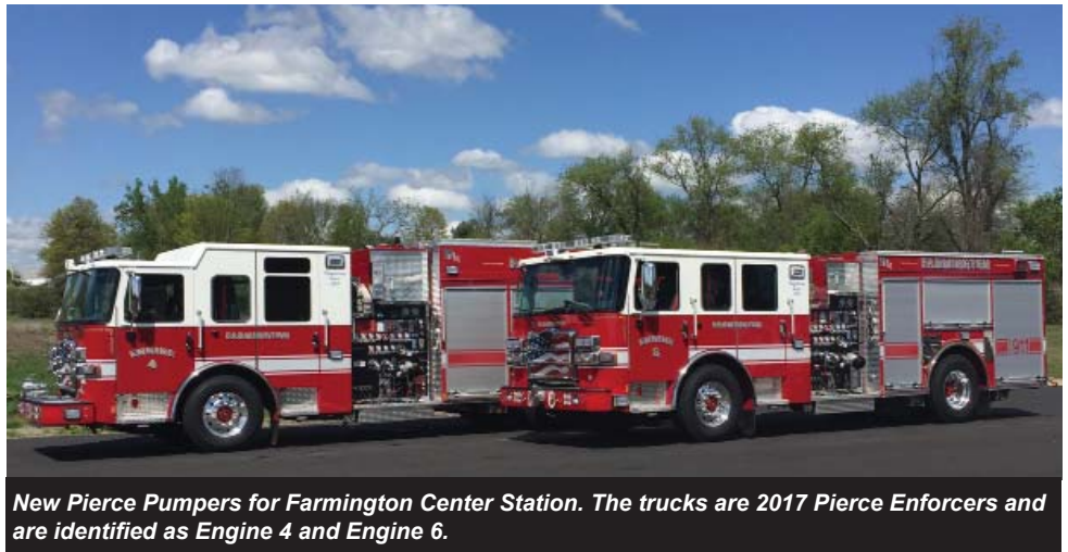
New Pierce Pumpers for Farmington Center Station. The trucks are 2017 Pierce Enforcers and are identified as Engine 4 and Engine 6.

The Fire Department is also actively recruiting Fire Cadets. The Fire Cadet Program is designed to encourage residents between 14 and 17 years of age to become familiar with the responsibilities of volunteer fire fighters, to demonstrate to young people the importance of service to the community through involvement in the volunteer fire department, and to develop a working knowledge of First Aid, Cardiopulmonary Resuscitation, and the Safe Working Practices associated with the Fire Service.