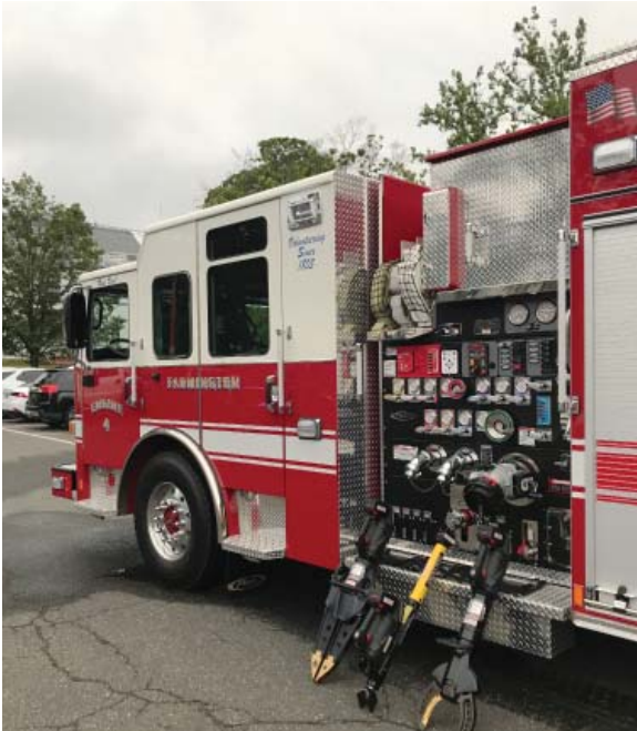
FARMINGTON VOLUNTEER FIRE DEPARTMENT