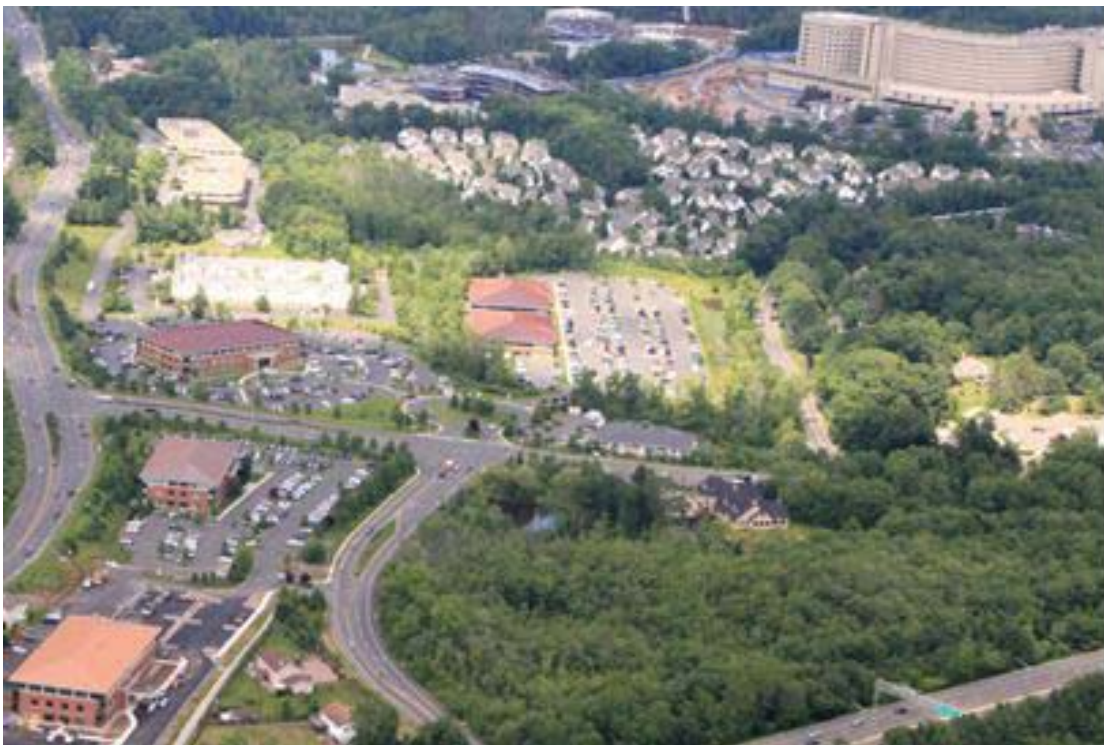
Thriving Medical Office Research Corridor