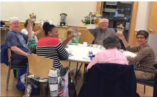
Congregate meal program

MEALS ON WHEELS: 5194 double meals delivered Mondays through Fridays, Birthday gift bags are delivered to each client on their special day.