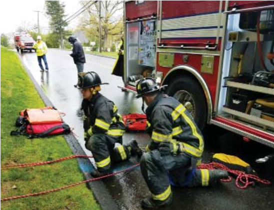
East Farms and Farmington Volunteer Fire Department members operating at scene of a rescue at the Holy Family Monastery on Tunxis Road

how to avoid them. If you are interested in having your group or organization tour the Fire Safety Trailer, please contact the Fire Department.