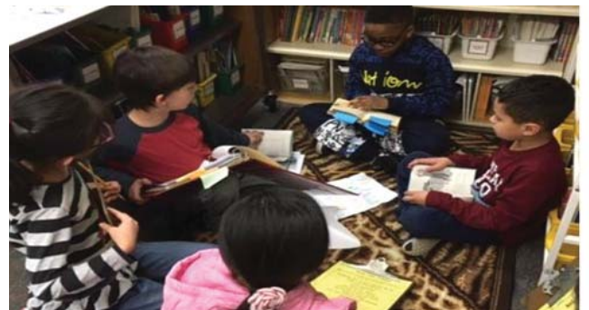
Critical Thinking and Reasoning