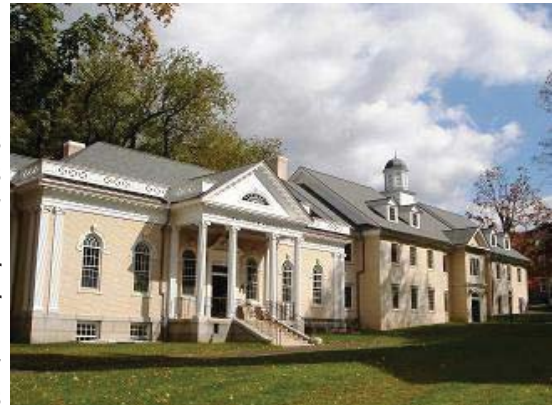
The Farmington Food Pantry is located on the lower level of Amistad Hall on the campus of First Church Congregational 75 Main Street, Farmington, CT

Since 2006, the Farmington Food Pantry has been located in Amistad Hall at The First Church of Christ in Farmington, operating under the Outreach Committee of First Church. Following a mission to provide a "respectful, empowering environment, where food and personal care items are available to individuals who need assistance in Farmington", the pantry currently serves over 200 Farmington families – a number that continues to grow each year. The pantry operates on a "Clients Choice" program which allows clients to pick the items they like and need, rather than being given a pre-packaged bag of food. As a partner agency of Foodshare, the pantry can receive food and household necessities for a nominal amount. The pantry is funded solely through donations and staffed entirely by volunteers. All clients are pre-qualified by social workers from the Town of Farmington Community & Recreational Services Department. Additionally, Farmington Community Services staff provides support during Tuesday shopping days allowing for increased communication with clients.